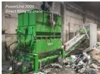
PowerLine 3000 Direct filling by crane