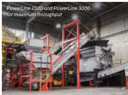
PowerLine 2500 und PowerLine 3000 for maximum throughput