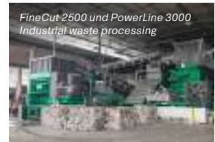
FineCut 2500 und PowerLine 3000 Industrial waste processing