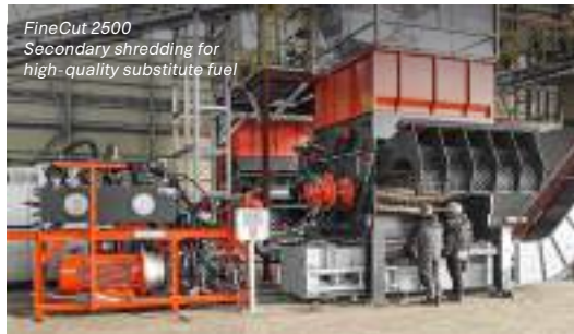
FineCut 2500 Secondary shredding for high-quality substitute fuel