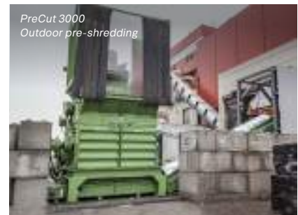
PreCut 3000 Outdoor pre-shredding