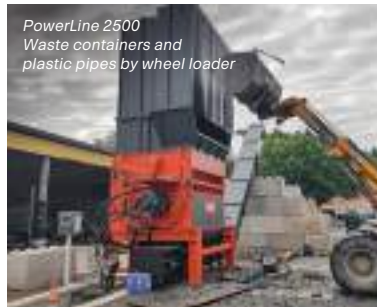
PowerLine 2500 Waste containers and plastic pipes by wheel loader