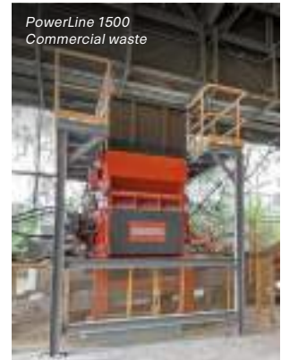
PowerLine 1500 Commercial waste