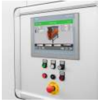
Flexible adjustment of cutting parameters with Siemens S7 PLC control

We manufacture our control cabinets ourselves in our German factories, using only brand-name components. With the large touch display, you have all important data and settings at your fingertips. The flexible adjustment of parameters such as the rotor speed or the ram movement is thus easily possible. For challenging conditions, we recommend optional control cabinet cooling.