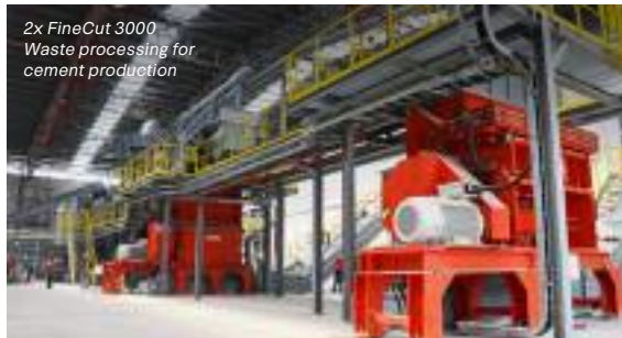
2x FineCut 3000 Waste processing for cement production