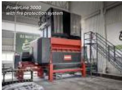
PowerLine 3000 with fire protection system